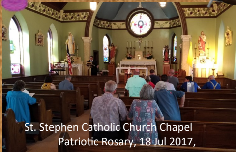
St. Stephen Catholic Church Chapel Patriotic Rosary, 18 Jul 2017,

Knights Social Hour Friday, August 11, 6PM At the Clubhouse. This event is also open to the ladies as well. BYOD