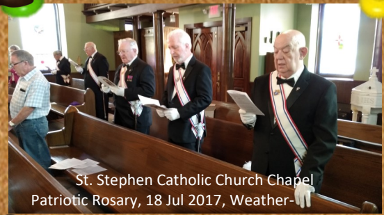
St. Stephen Catholic Church Chapel Patriotic Rosary, 18 Jul 2017, Weather-

Knights Social Hour Friday, August 11, 6PM At the Clubhouse. This event is also open to the ladies as well. BYOD